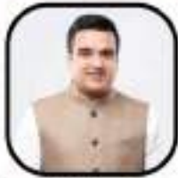
Shri Harshbhai Sanghavi Hon'ble Deputy Chief Minister Hon'ble Minister of Sports Government of Gujarat