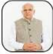
Shri Bhupendrabhai Patel Hon'ble Chief Minister of Gujarat