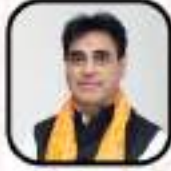
Shri Prafulbhai Pansheriya Minister of State (Independent Charge) Health & Medical Education, Government of Gujarat